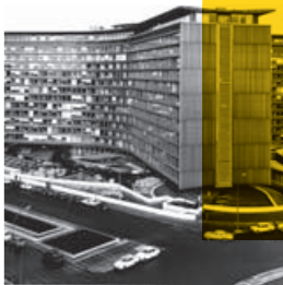
Commission européenne / Europese Commissie © 1971 / Sergysla Dierens