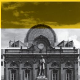
Parlement européen / Europees Parlement © Architecte: Association des architectes du CIC: Vanden Bossche sprl / CRV sa / CDG sprl / Studiegroep D. Bontinck